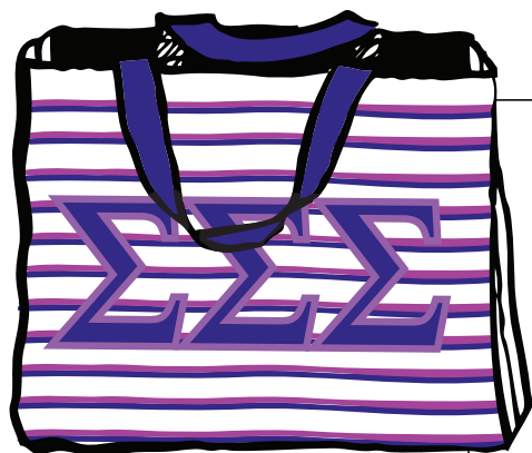
Bag (14.5" x 14")