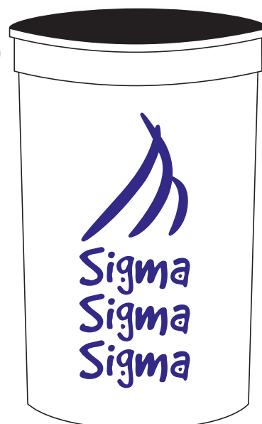
Stadium Cup (22 oz.)